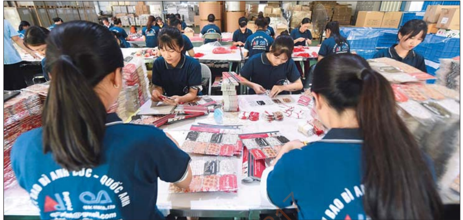
Workers make Christmas cards in a factory in Hun Yeh, China, recently.

● Weak PMI readings spark concerns about stalling economy ● Export, import orders both weaken