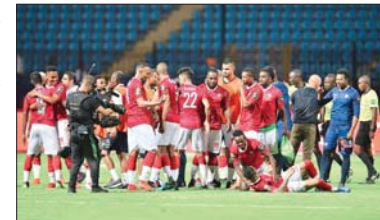
Madagascar's players rejoice after winning their 2019 Africa Cup of Nations Group B match against Nigeria at the Alexandria Stadium on Sunday.