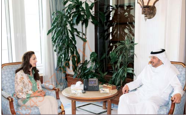
Prime Minister and Minister of Interior HE Sheikh Abdullah bin Nasser bin Khalifa al Thani met Ambassador of the Kingdom of Spain to Qatar HE Belen Alfaro in Doha on Sunday. During the meeting, they reviewed the bilateral relations and the means to bolster them in different fields.