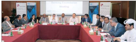
Trade finance and legal experts from most of the national banks operating in Qatar took part in the ICC Qatar's Banking Commission meeting in Doha recently.

QCB is scheduled to hold a meeting with representatives of national banks operating in Qatar to discuss the Demand guarantee letter, with the participation of International Chamber of Commerce Qatar (ICC Qatar) and representatives of Qatari companies.