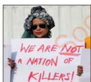
A Sri Lankan woman during a protest in front of the Welikada Prison in Colombo, Sri Lanka, recently.

"The Court of Appeal will have a preliminary hearing next week. In the meantime, the prisons commissioner has given an assurance to court that there will be no hangings," a court official told AFP.