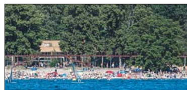
People through the beach at the open air lido Strandbad Wannsee in Berlin, Germany, on Sunday.

In Rome, Pope Francis told pilgrims on Saint Peter's Square: "I pray for those who have suffered the most from the heat in recent days; the