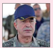
Turkish Defence Minister Hulusi Akar.

TURKISH Defence Minister Hulusi Akar has threatened to retaliate against potential attacks after forces of the military strongman controlling eastern Libya threatened to target Turkish interests in the country.