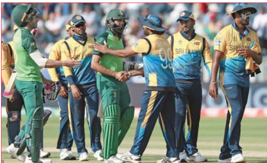
South Africa's Hashim Amlia shakes hands with Sri Lankan players after winning the Cricket World Cup match at Chester-Le-Street, England, on Friday.

matches, so we couldn't get a hundred, only a couple of 50s in our team, so that is the only major thing.