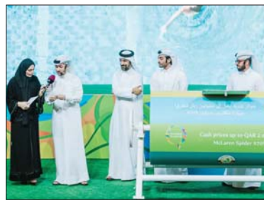
The first of the three SIQ raffle draws was held at Lagoona Mall recently.

Running between June 4 and August 16, SIQ is introducing a range of exciting experiences, along with entertainment programmes featuring local, regional and international artists, as well as edutainment, summer and sports camps. This is in addition to the special promotions on inbound travel, hospitality and shopping. (TNN)