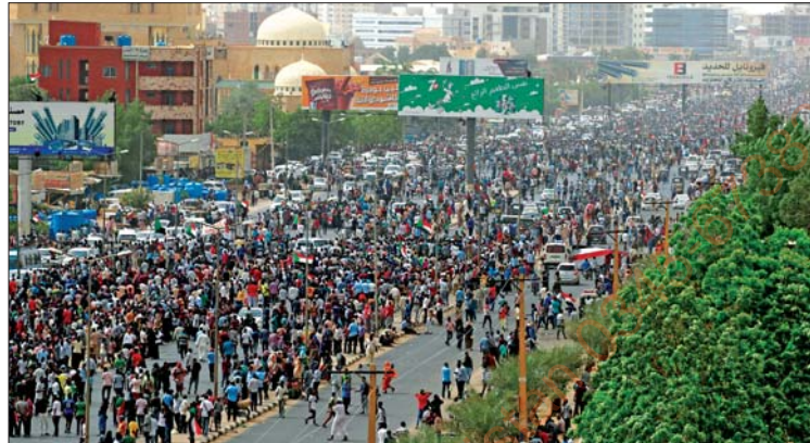
Tens of thousands of people march on the streets demanding the ruling military hand over power to civilians, in Khartoum on Sunday.

AFP KHARTOUM The 'million-man' march is being seen as a test for protest organisers whose push for civilian rule has been hit by the June 3 raid on a Khartoum sit-in and a subsequent internet blackout that has curbed their ability to mobilise support.