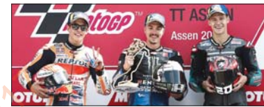
Winner Maverick Vinales (centre), Marc Marquez (left) and Fabio Quartararo after the MotoGP Race on the Assen TT circuit on Sunday.

clear, at the moment," said Binotto. "The regulation is causing a collision, or forcing a car off track. I think both situations were there and we trust the work of the stewards." Red Bull team boss Christian Horner took a different view ahead of the hearing. "Max has got the opportunity – he's fully alongside, fully up the inside and, at that point, Max can't get out of the way. "Leclerc has to concede the corner at some point. It's clean. He's right there. Obviously, he came in aggressively, but what are you supposed to do? "If they take this victory away from Max here, in my view it would be stealing from Formula One," he said. The Dutch man's win brought an end to Mercedes' record unbeaten start to the season and broke the Silver Arrows' stronghold after ten straight wins overall. It also showed that one week on from the dreary procession at the French Grand Prix, Formula One remains a sport that can produce a thrilling spectacle in the right conditions and at the right circuit.