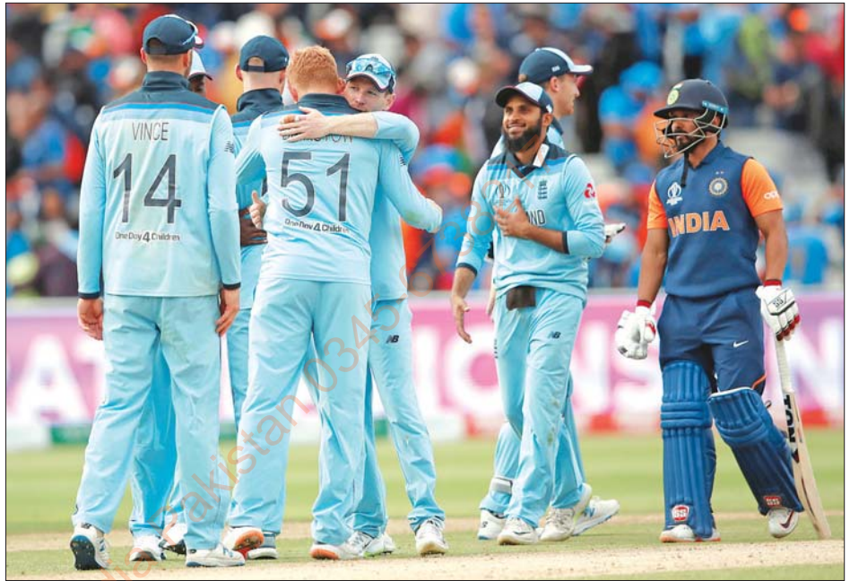
England's Eoin Morgan celebrates with Jonny Bairstow and teammates after they beat India in the crucial World Cup group stage match at Edgbaston on Sunday.

England reached the 150 mark in the 21st over and it took a stunning catch by sub-