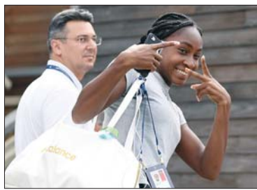
Cori Gauff of the US gestures as she arrives for a practice session at the All England Lawn Tennis and Croquet Club in London.

The level-headed teenager was taking it all in her stride though and if there were nerves as she practised at the weekend, she was hiding them well. "I kind of fell like I was