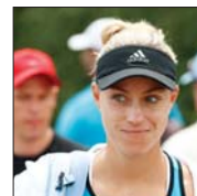
Defending champion Angelique Kerber of Germany.

Also in her section are new world number one and Roland