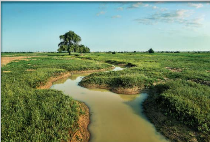
The picture shows an area being developed for agriculture at Al Ghaf near the Al Shamal area. With the support of the government, a large number of young farmers have developed these areas into agriculture plots.