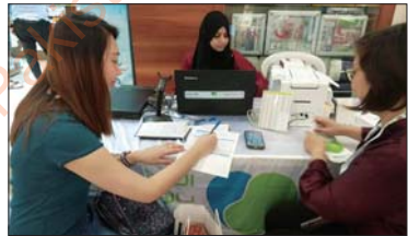
The organ donor registry of the HMC registers about 300 to 500 potential organs donors on a daily basis.

The organ donor registry of the HMC registers about 300 to 500 potential organs donors on a daily basis, especially during the campaign which begins during the Holy Month of Ramadan. The Qatar Organ Donor Registry was launched in 2012.