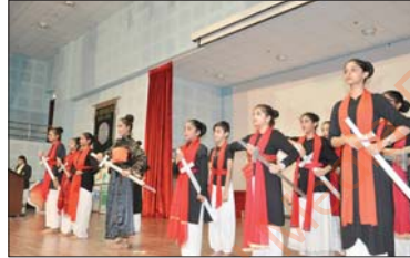
DPS-Modern Indian School students participate in an activity during their annual inter-house activity event for middle school students.

The event underpins the vision and mission of the school, which is to provide a richly varied pattern of activities for the all-round growth of students. It featured a variety of activities i.e. cooking without fire, group song, just a minute, story writing, debate, junk art, group dance, T-shirt painting, greeting card making, poster making and hand writing for the