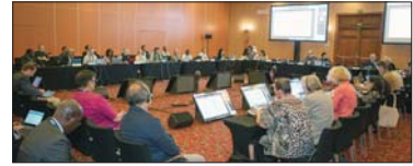
The meeting discussed policy work and community outreach in addition to a range of important issues affecting the Internet community.

THE Communications Regulatory Authority (CRA) participated in the 65th meeting of the Internet Corporation for Assigned Names and Numbers (ICANN65 Policy Forum), which was held on June 24-27, in Marrakech, Morocco, with the participation of Internet experts from around the world.