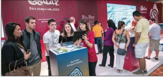
Fans at the Qatar @roadto2022 Exhibition at the JK Iguatemi Mall in Sao Paulo, Brazil.

THOUSANDS of people visited the Qatar @roadto2022 Exhibition in Sao Paulo to find out more about the next FIFA World Cup host nation. The installation, at JK Iguatemi Mall, was organised by the Supreme Committee for Delivery & Legacy (SC) and Qatar Football Association (QFA) – and coincided with Qatar's participation in the Copa America for the first time. Almost 10,000 people visited the exhibition, which featured FIFA World Cup™ memorabilia, crowdsourced photographs, models of the eight Qatar 2022 stadiums and details about Qatar's Asian Cup victory. In addition, the SC announced Brazilian legend Cafu as its latest ambassador during the exhibition run. Twice a FIFA World Cup winner, Cafu