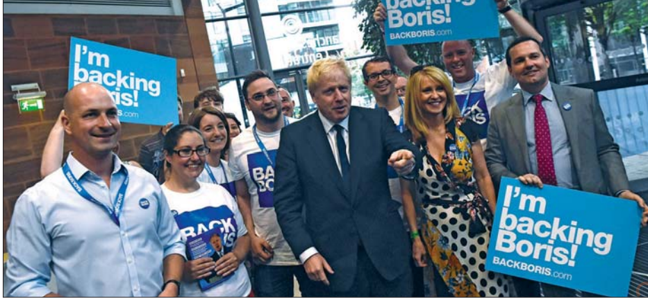
Boris Johnson is greeted by supporters as he arrives to take part in a Conservative Party hustings event in Manchester on Saturday.

• Both pledge to cut taxes, spend on services • Hunt escalates rhetoric over no-deal Brexit