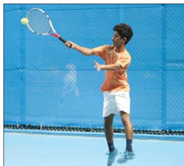
A Qatari tennis player in action in Doha.