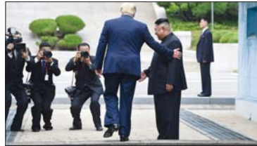
US President Donald Trump steps into the northern side of the Military Demarcation Line as North Korea's leader Kim Jong Un looks on, in the Joint Security Area (JSA) of Panmunjom DMZ, on Sunday.

willing to put the past behind us." The impromptu meeting in the DMZ — after Trump issued an invitation on Twitter on Saturday — came with negotiations between Pyongyang and Washington at a deadlock. Their first summit took place in a blaze of publicity in Singapore last year but produced only a vaguely worded pledge about denuclearisation. A second meeting in Vietnam in February intended to put flesh on those bones broke up without agreement.