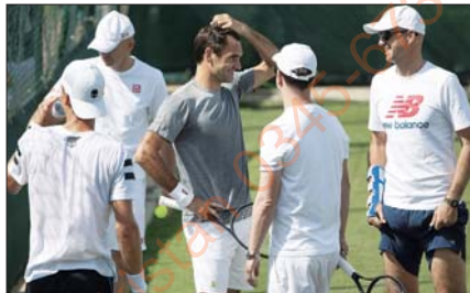
Novak Djokovic (left), Roger Federer (center) and Tomas Berdych during a training session at the All England Lawn Tennis Championships in Wimbledon, London, on Sunday.

gery, being unable to have consistency with results, this was a huge springboard for me, the win at Wimbledon last year," said Djokovic, who will take a 10-2 career record over Philipp Kohlschreiber into their first-round clash on Monday.