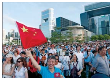
A supporter holds a flag as he attends a rally to show support for the police amid criticisms for its alleged mishandling of an anti-extradition protest, in Hong Kong, on Sunday.

US and Iran are rooted in the unilateral decision by the US to withdraw from the 2015 nuclear deal, he said. "That decision has to be reversed," he added. US President Donald Trump has imposed sanctions on Iran, including a new round announced on Monday, as part of a "maximum pressure" campaign to bring Iran to negotiations. Trump has threatened to continue to increase pressure on Tehran, adding that the US has shown restraint in a row between