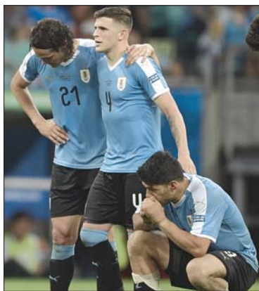
Uruguay's Luis Suarez (bottom right) whose penalty was stopped by Peru's goalkeeper Pedro Gallese reacts next to teammates Edison Cavani and Giovanni Gonzalez during the penalty shoot-out of their Copa America quarter-final match at the Fonte Nova Arena on Saturday.

LUIS Suarez broke down in tears after his shootout miss saw Uruguay dumped out of the Copa America by unfancied Peru on Saturday, the 15 times champions losing 5-4 on penalties after having three goals ruled out in a scoreless draw. Suarez spurned the first penalty of the shootout, his effort bouncing off the chest of Peru goalkeeper Pedro Gallese, to complete a frustrating evening for Uruguay's all-time top scorer, who also had a goal ruled out for offside. Every other player converted their spot kicks and Edison Flores sealed Peru's place in the last four by blasting past Fernando Muslera. Suarez, who rushed back to full fitness after undergoing knee surgery in May in order to make it for the Copa, covered his face with his shirt and was consoled by team mates after the shootout defeat. "Luis was very sad, he ended up missing in a decisive moment but that's football and life," Edison Cavani told reporters. "Sometimes you win, sometimes you lose. We have won the Copa before but today we