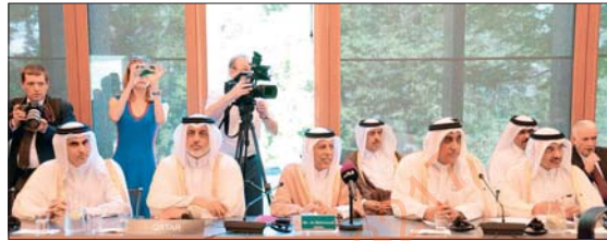
Speaker of the Shura Council HE Ahmed bin Abdullah bin Zaid al Mahmoud and other council members at a meeting in Geneva on Sunday.

Mahmoud said the meaningful speech delivered by the Amir HH Sheikh Tamim bin Hamad al Thani during the opening session was the highlight of the event, where HH the Amir reiterated support to democracy, human rights