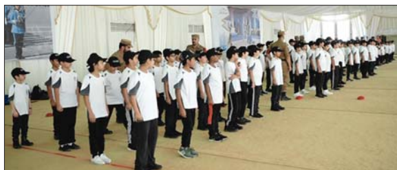
The six-week programme will feature an array of activities, including sport training designed to keep the children physically and mentally fit during the summer holidays.

"We have divided the students into six groups. Each group will undergo a two weeks train-