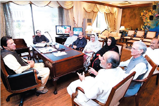
ISLAMABAD: A delegation of parliamentarians from Balochistan Awami Party calls on Prime Minister Imran Khan.