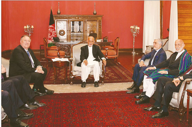
Secretary of State Mike Pompeo (left) meets Afghan President Ashraf Ghani, Afghan Chief Executive Officer Abdullah Abdullah, and former Afghan President Hamid Karzai, right, at the Presidential Palace in Kabul, Afghanistan.