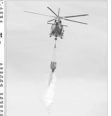
The fire brigade staff use a helicopter to collect water during a forest fire in Lieberose, eastern Germany as temperatures topped 36 degrees Celsius.

SINGAPORE: French restaurant Mirazur run by Argentine chef Mauro Colagreco was Tuesday crowned the world's best restaurant at an awards ceremony put on by British trade magazine Restaurant.