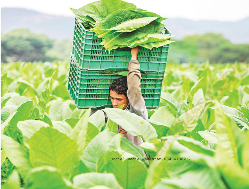
ESTEL: A worker carries boxes with tobacco leaves at a farm in Nicaragua. The Latin American country is consolidating as the largest exporter of cigars to the US.