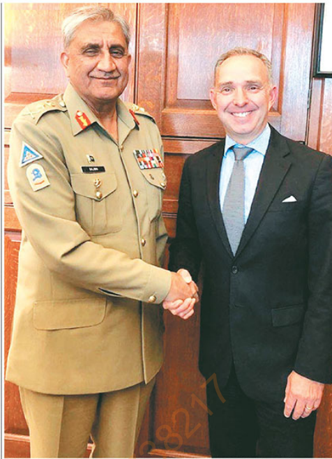
LONDON: COAS Gen Qamar Javed Bajwa shakes hands with British National Security Adviser Sir Mark Sedwill during a meeting at the Cabinet Office.