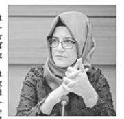
Turkish writer and fiancee of the murdered Saudi journalist Jamal Khoshoggi, attends a side event at UN Human Rights Council in Geneva.

GENEVA: The Turkish fiancee of murdered Saudi journalist and dissident Jamal Khoshoggi insisted in an emotional interview Tuesday that Washington has the ethical responsibility to initiate an international investigation into his killing.