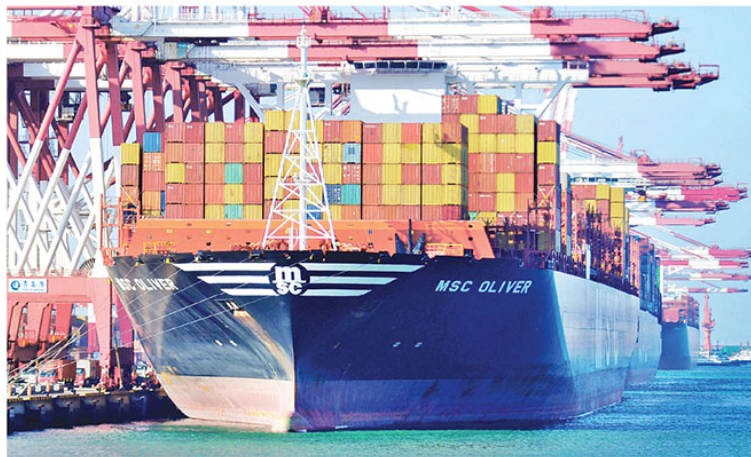
Photo shows containers on a ship at the Qingdao Port Foreign Trade Container Terminal, in Qingdao, in China's eastern Shandong province. Top Chinese and US trade negotiators have held telephone talks ahead of a crunch meeting between presidents Xi Jinping and Donald Trump at the G20 summit this week, Chinese state media said on Tuesday