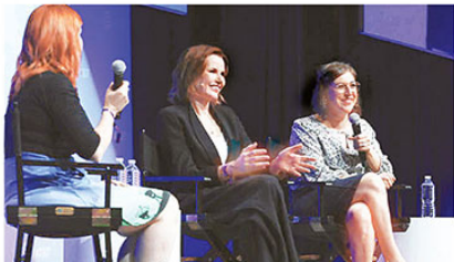
Geena Davis and Mayim Bialik speak at AT&T's Shape conference: The Scully Effect Is Real panel.

show about a group of people just kind of being themselves in the science world, and that's what my life and many of our lives are like.” According to Bialik, seeing characters like Scully onscreen and having real-life mentors is crucial for young women to pursue careers in science, medicine and engineering. “I was raised in a climate where if you didn't learn things as fast as the boys, it meant that it wasn't for you. It's important to have a mentor, to have someone that you can see is living the life of a scientist and also has a social life – all the things that the lone scientist in the laboratory stereotype doesn't give us,” she added. The panelists further said that all forms of diversity onscreen are necessary, pointing to films like Hidden Figures , which is about the key role a group of African-American women played in the U.S. space program, as leading the way for more complex stories on people of any gender or race. At the event, Geena Davis shared that she thinks all forms of diversity need to be shown onscreen and also stressed on the fact that Hollywood isn't as progressive thinking as it is perceived. “As much as people think Hollywood is liberal and open-minded and progressive thinking, they're doing a worse job of reflecting society than the abysmal numbers in real life,” Geena Davis said. “If we show it, it will happen in real life.”