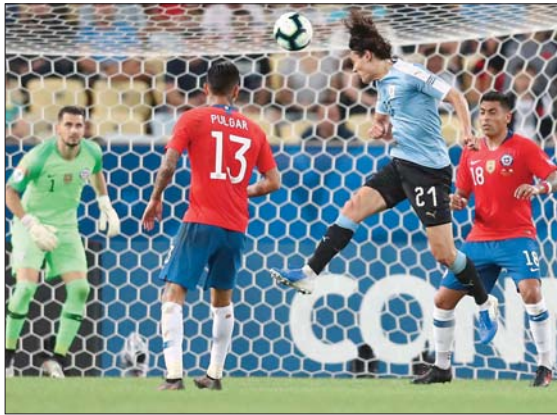
Uruguay's Edinson Cavani scores the winner against Chile during their Group C match of 2019 Copa America championship at the Maracana Stadium in Rio de Janeiro on Monday.

But the Paris Saint-Germain forward insisted thoughts of a potentially easier quarter-final draw played no role in Uruguay's approach.