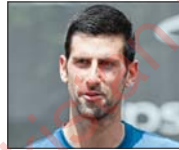
Novak Djokovic speaks to the media recently ahead of Wimbledon.

SPANIARD Rafael Nadal received support from Wimbledon champion Novak Djokovic on Tuesday after criticising the unique seedings formula used by the grasscourt Grand Slam which gets underway at the All England Club on Monday.