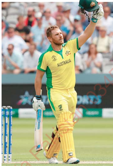
Australia captain Aaron Finch celebrates his century against England at Lord's in London on Tuesday. Finch topscored for his side with an exact 100.