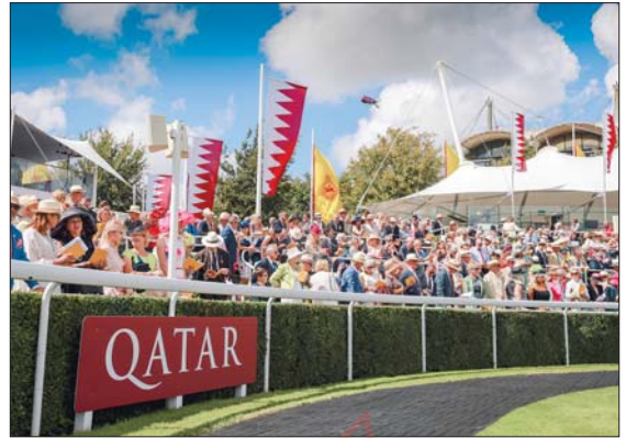
A vibrant and colourful view of the Qatar Goodwood Festival.

It is worth mentioning that Qatar's sponsorship of the Qatar Goodwood Festival is the first of its kind for Qatar's equestrian sport and horseracing in the United Kingdom. The Qatar Goodwood Festival also features some of the top races for thoroughbreds, including the Qatar Goodwood Cup (Gr 1), the Qatar Sussex Stakes (Gr 1), the Qatar Nassau Stakes (Gr 1), the Qatar Lillie Langtry Stakes (Gr 2), the Qatar King George Stakes (Gr 2) and the Qatar Gordon Stakes (Gr 1).