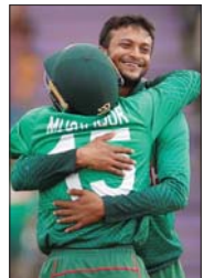
Bangladesh's Shakib Al Hasan and Mushfiqur Rahim celebrate taking an Afghanistan wicket in Southampton on Monday.

"If you look at New Zealand and Colin de Grandhomme chipping in England have a number of guys who are specialist bowlers but they can also bat and that is what makes them such a strong unit."