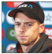
New Zealand's Mitchell Santner

The Kiwis are currently at the top of the table with 11 points from six matches, with captain Kane Williamson winning plaudits for racking up 373 runs at an average of 186.50.