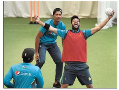
Pakistan's Imad Wasim holds the ball as he takes part in a training session at Edgbaston in Birmingham on Tuesday.

"They've got match winners in their side, so it's going to be crucial for us to take