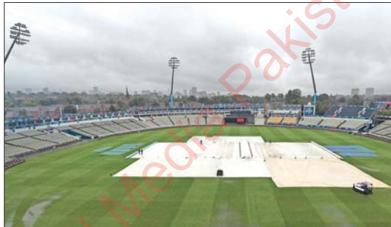
Groundstaff work on a rain soaked pitch at Edgbaston in Birmingham on Tuesday, the eve of the ICC World Cup match between Pakistan and New Zealand.

But with only West Indies scoring more than 250 against New Zealand, and fast bowlers Lockie Ferguson and Trent Boult combining to take 22 wickets, Santner feels it has been an all-round effort with each member