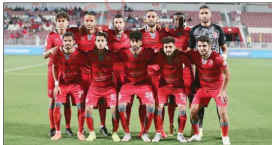
Amer Cup champions Al Duhail will travel to the Portuguese capital of Lisbon from July 1 to July 26 for their training camp in preparation for the 2019/2020 season. Al Duhail will start the season with the AFC Champions League round of 16 clash against rivals Al Sadd on August 6. Both teams will then clash again for the Qatari season-opener Sheikh Jassim Cup on August 17.