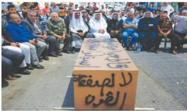
HEBRON: Palestinian men sit around a makeshift table with the words, "No to the deal of the century", during a protest on Monday against a US-led meeting in Bahrain.—AFP

The state relative was accused of moving money around bank accounts "to prevent the origin and actual destination of the funds from being identified," the attorney general said in a statement.—AFP