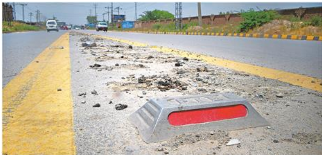
REFLECTORS stolen from the Hayatabad Industrial Zone Road, Peshawar, invite attention of the authorities concerned.—Write Star