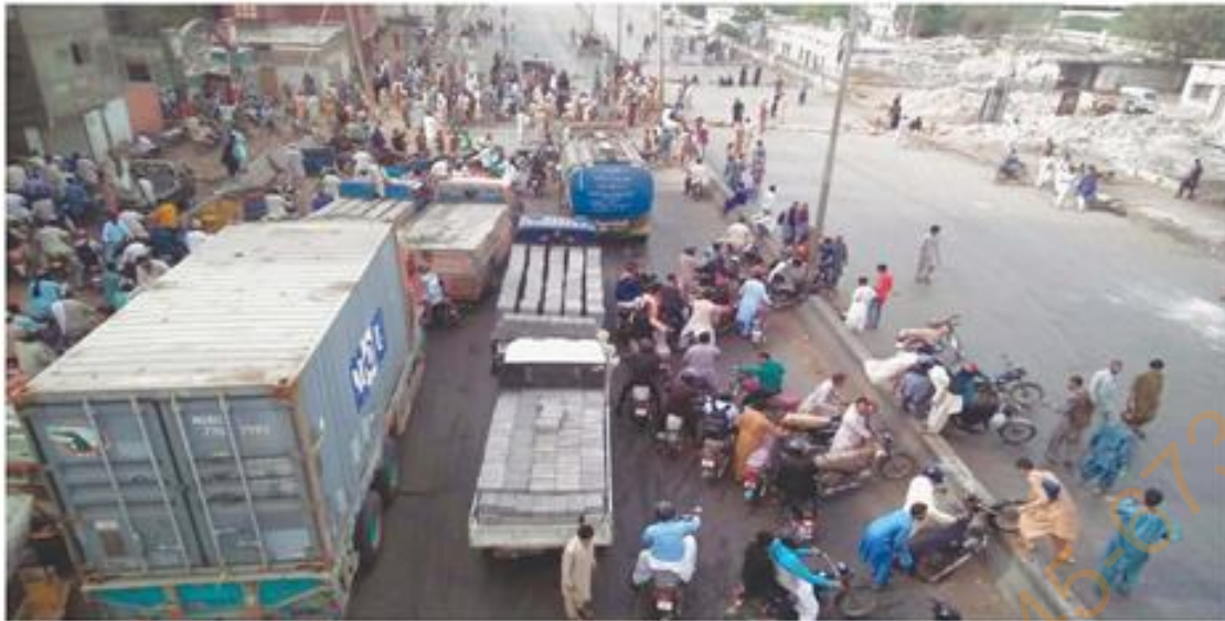
RESIDENTS of Lyari block Maulipur Road on Monday in protest against prolonged loadshedding and water shortage in their area.