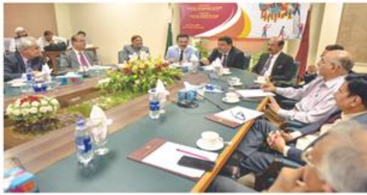
HEADS of various academic institutions discuss the issue at the KU Vice-Chancellor's Secretariat on Monday.