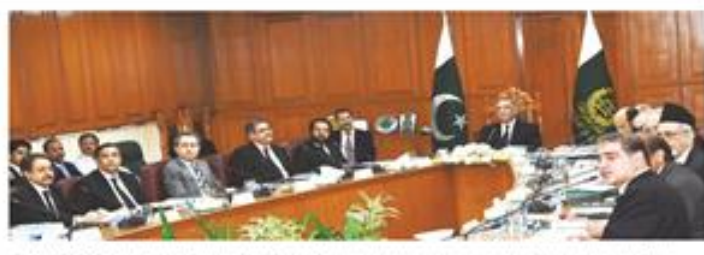
ISLAMABAD: Chief Justice of Pakistan Asif Saeed Khosa presides over a meeting of the National Judicial Policy Making Committee on Monday.

In his petition, the ex-spy master said the interior ministry despite lapse of three months was yet to decide his representation for review of its decision on his travel ban.