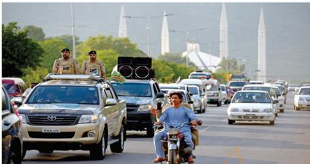
An anti-drug car rally passes through Faisal Avenue in Islamabad on Monday. The rally, which was organised by the Ministry of Narcotics Control, aimed at creating awareness of the hazards of drug use.

Former minister Farooq Anjum Bahar said while there had been global improvements, children had not been on the agenda of governments and political par-