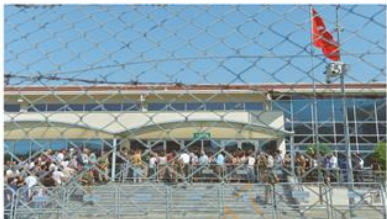
SILVRI (Turkey): Soldiers stand outside a court in a prison complex where the trial of civil society leaders began as people arrive to attend the proceedings on Monday.