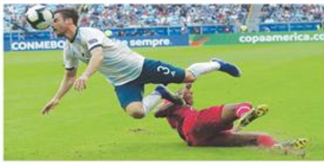
PORTO ALEGRE: Argentina's Nicolas Tagliafico (L) and Qatar's Pedro Correira vie for the ball during their Copa America match at Arena do Gremio.—AP

The two were the only candidates left after four other cities — Swiss city St. Moritz, Japan's Sapporo, Austria's Graz and 1988's Calgary in Canada — had dropped out of the race with concerns over the size and cost of the event.—Reuters