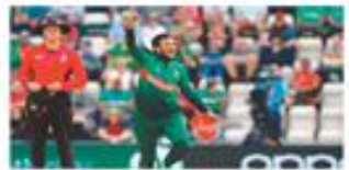
All-round Shakib keeps BD in hunt for semis

Minimum 25°C Maximum 37°C Outlook Hot and Dry