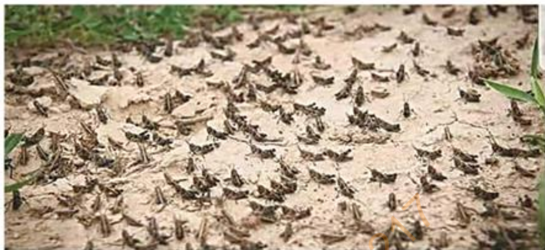
A SWARM of locusts moves about a field in Dadu.

Sindh Abudger Board (SAB) and South Chamber of