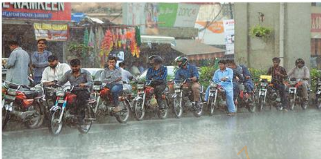
MOTORCYCLISTS take shelter under the metro bus track on Murree Road in Rawalpindi during rain on Monday. According to the Met Office, the first spell of pre-monsoon rains has commenced

The testing service has charged Rs350 from each candidate. The DIG headquarters said, adding the government would also pay a similar amount to the testing service for each eligible candidate.