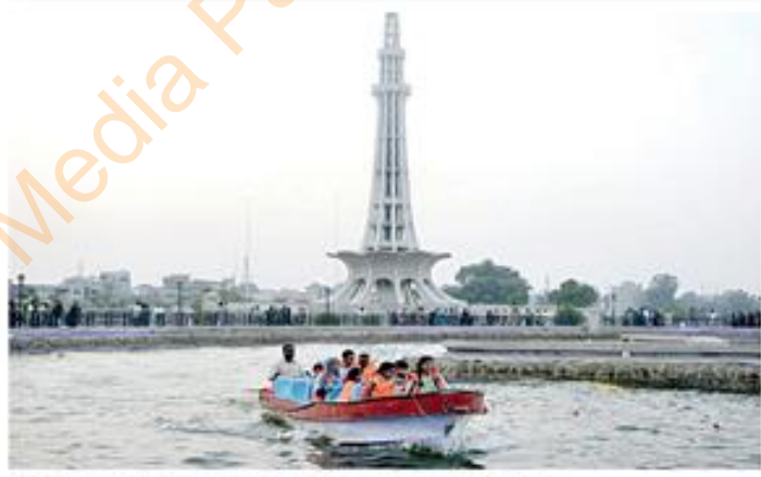
LAHORE: People enjoy boating at the Greater Iqbal Park on a pleasant day.