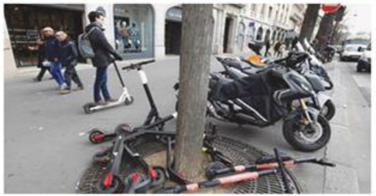
PARIS: This March 27 file photo shows a man riding an electric scooter on the sidewalk.

But the United Arab Emirates is shooting to outdo Qatar with its Dubai-based Mohammed bin Rashid Library, hoping to house 1.5 million volumes when it opens. Tensions between the UAE and Qatar erupted in June 2017 when the Emirates joined a Saudi-led alliance that imposed an economic and diplomatic boycott on Doha, accusing it of supporting Iran and Islamist movements — charges Qatar denies.—AFP