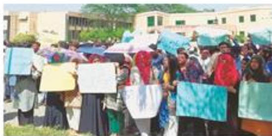
STUDENTS of UET Taxila protest outside the academic block on Monday