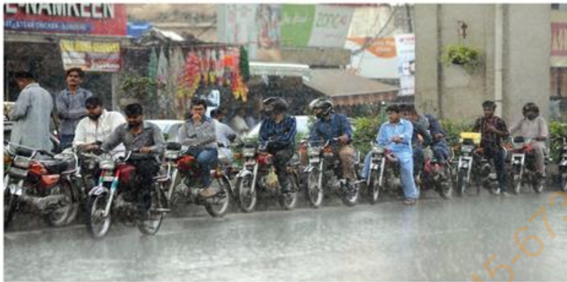
MOTORCYCLISTS take shelter under the metro bus track on Murree Road in Rawalpindi during rain on Monday. According to the Met Office, the first spell of pre-monsoon rains has commenced.