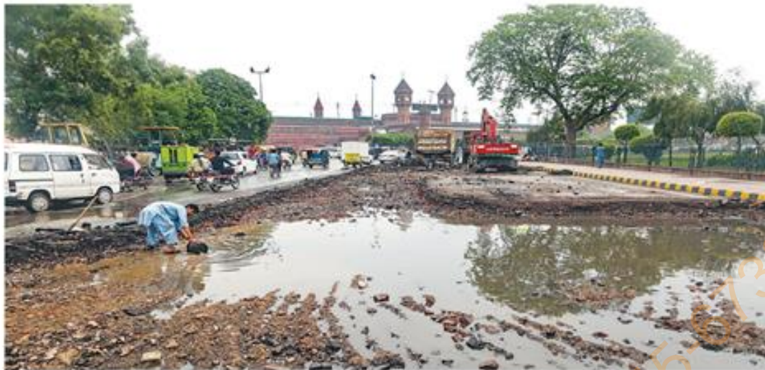
A LABOURER drains out rainwater from the road dug up for reconstruction near the railway station.