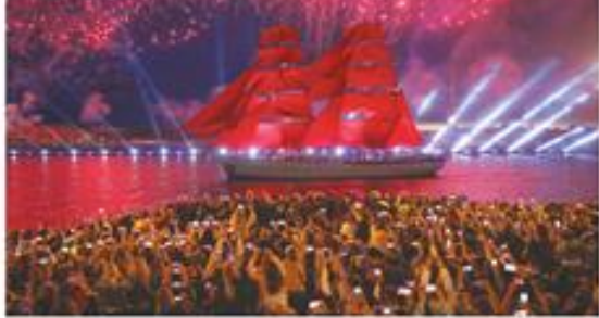
ST PETERSBURG (Russia): People watch fireworks and a big with scarlet sails floating on the Neva River during festivities on Monday to mark school graduation. Graduation ceremonies and celebrations are being held all over Russia this week as students of elementary and high schools finish their education.