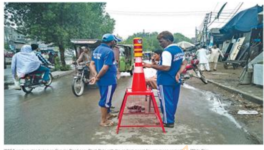
WMSA workers stand alert on Circular Road near Shal Gate with the gadget meant for rain measurement.

By Our Correspondent TIKRA GHIAZI KHAN: Two teenage sisters were injured when the roof of their room caved in due to rain in Abdullah Town of the city on Sunday night. The sisters, identified as Ahsan and Saba, were feared under the collapsed roof of their small house. Rescuers shifted them to the teaching hospital of Ghazi Khan Medical College where condition of both the sisters was stated to be stable. The heavy downpour disrupted the routine life as the rainwater inundated the roads and streets of the city.