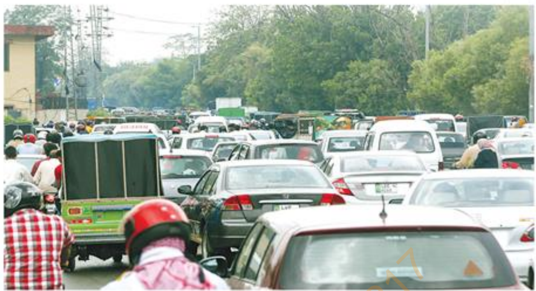
LAHORE: A traffic mess on Canal Road near Dhasapura.

They said 18,000 cusecs water was being released in Marala Haveli Link Canal and 12,523 cusecs in Upper Chenab Canal. Both the main canals originate from River Chenab at Head Marala.