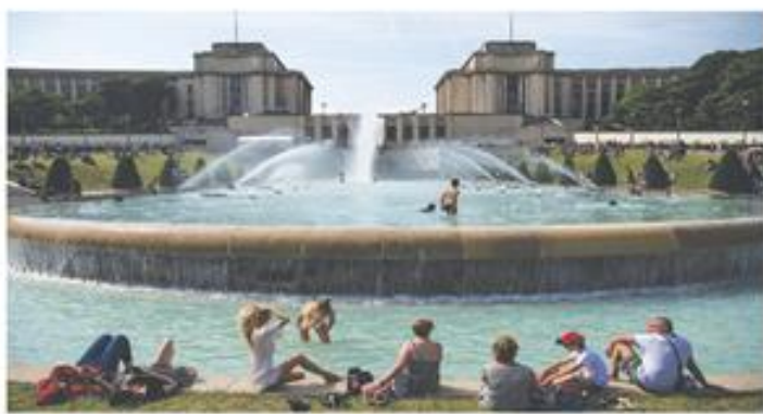
PARIS: Youngsters cool themselves down in a pond at Trocadero esplanade as temperatures soared to 33 degrees Celsius.—AFP

When asked the naughtiest thing he had ever done, Hunt said: "When I was backpacking through India, I once had a Bhag Laxi — which is a kind of cannabis leaf — that's the naughtiest thing I am prepared to confess to on this programme." —Reuters