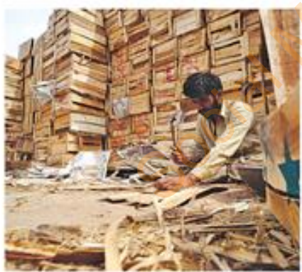
A MAN is making wooden boxes for packing mangoes at the fruit market.

He said textile millers were worried that their products were not finding markets abroad, farmers were also crying because of the PTA's policies as the economic figures released by state institutions show that investment ratio declined sharply during the last 10 months.