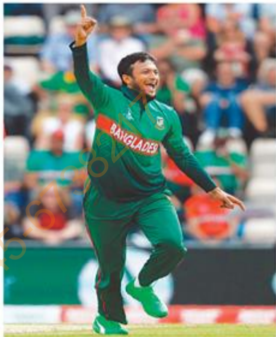
SOUTHAMPTON: Afghanistan batsman Mohammad Nabi is cleaned up by Bangladesh spinner Shakib Al Hasan during their match at the Rose Bowl on Monday. (R) Shakib wheels off in celebration following a dismissal

SOUTHAMPTON: Bangladesh boosted their bid to reach the World Cup semi-finals as Shakib Al Hasan's superb all-round display inspired a 62-run win over Afghanistan on Monday.