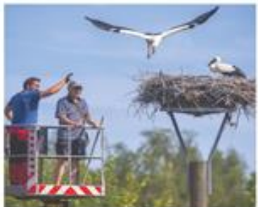
CAMMIN (Germany): Animal keepers are on their way to pick him (young storks in their nest) on a tree.