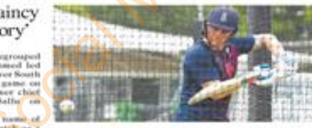
LONDON: England's Jason Roy bats during a nets session on Monday