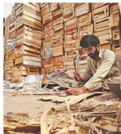
LAHORE: A man is making wooden boxes for packing mangoes at the fruit market

The report also notes defective operating planning by the Karachi control office as one of the causes behind the accident.