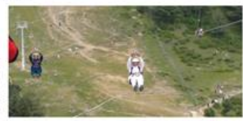
TOURISTS enjoy the zip line ride in Malam Jabba, Swat. — Dawn

MINGORA: A large number of tourists flocked to Swat to experience the country's biggest zip line at 9,200 feet high Malam Jabba ski resort. The newly installed zip line is about 1,000 feet high and about 2,000 feet long and its speed can reach to 80 kilometers per hour. The tourists in Malam Jabba, queuing to experience the adventure of the newly installed zip line, said that they were excited to have an opportunity of sliding down the wire for the first time in life. "I have seen zip lining on TV and on internet which always fascinated me. When I learnt that a zip line was installed in Malam Jabba, I decided at once to visit it and experience the thrilling ride. Today my dream is coming true to and I am excited," said Jamil Ahmad, a tourist from Peshawar, who was waiting for his turn. Sera Yousof, a tourist from Lahore, who visited Malam Jabba with her family, said that she was excited to experience adventurous activities. "We all are excited to have this adventurous trip and experience wild climbing and zip lining in Malam Jabba. I