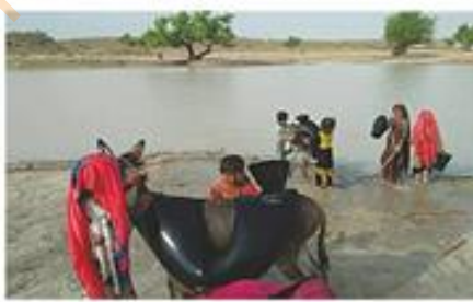
CHILDREN fill their utensils with water from a pond replenished after recent rains in desert region of Thar.

They said that it had caused food and medicine shortages but