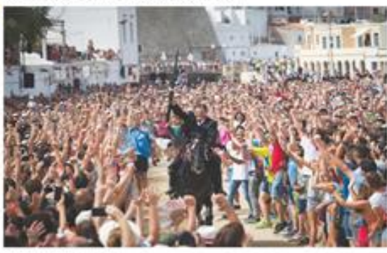
CIUTADELLA (Spain): A rider gallops with a spear during the 'Caragol dee Bom', a mass gathering of horses and people swilling to music during a traditional festival on Monday.