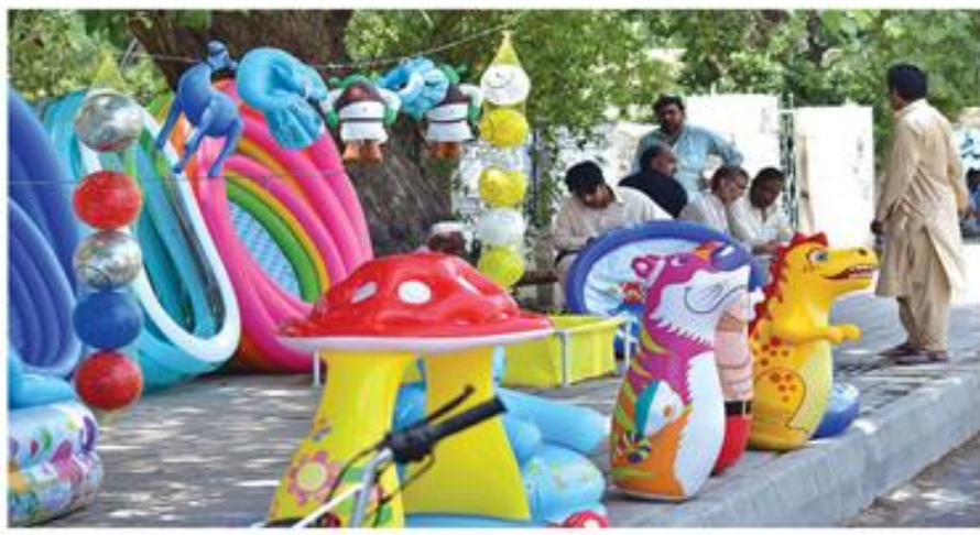
A VENDOR sells inflatable toys along Sher Shah Suri Road, Peshawar.