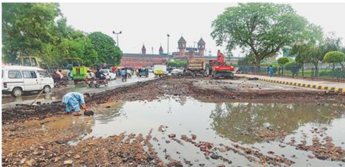
LAHORE: A labourer drains out rainwater from the road dug up for reconstruction near the railway station

Fatima said she had invited to philanthropists to donate money so that modern medical equipment, beds etc could be purchased and installed in the building located on Highway Road, Kamalia. —Correspondent