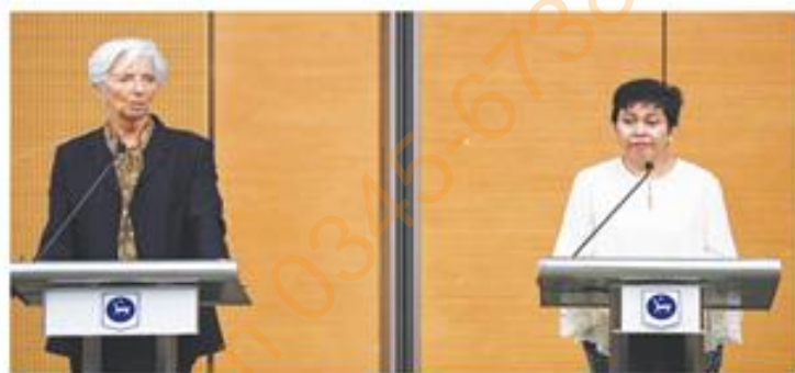
KUALA LUMPUR: International Monetary Fund (IMF) Managing Director Christine Lagarde (L) speaks as Governor of the Monetary Authority of Singapore (MAS) during a press conference on Monday.