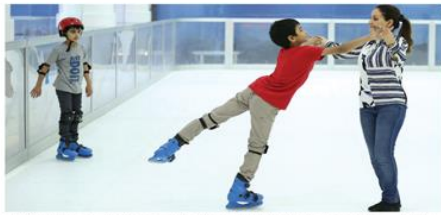
A SKATER gets training in figure skating at a camp arranged by the Winter Sports Federation of Pakistan in Islamabad on Monday.