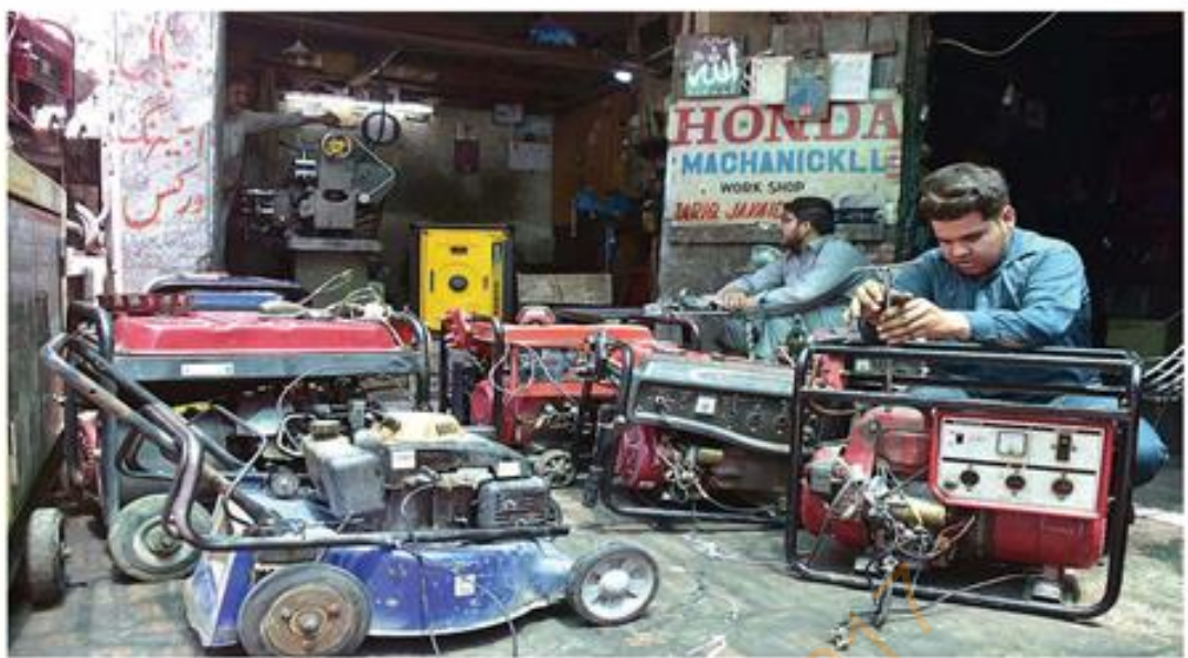
A MECHANIC repairs a power generator at a workshop in Peshawar.

The coal mine workers welfare association (CMWFA) thanked the minister for upholding the rights of coal mine workers.