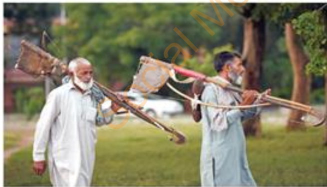
WITH everything readymade now from quilts to pillows, the work of cotton fluffers has reduced considerably. One rarely sees them, but there are several families who still prefer the old method of fluffing cotton. These cotton fluffers visit homes after every few months and refill mattresses, quilts and pillow and that too at a much lesser cost. In the picture, two cotton flufflers leave a house in F-7 after doing their day's work.

The committee recommended that expatriate disabled persons and senior citizens should be given exemption from biometric verification of their bank accounts. The committee decided that the matter would be taken up at its next meeting.