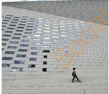
BORDEAUX (France): A woman walks past the MECA building, a newly-built regional hub for cultural activities, before its inauguration on June 28. The building, designed by Danish architect Bjarke Ingels, will host several cultural institutions: an agency to promote art, a centre for cinema, theatre and audiovisual activities, and a public collection of contemporary art.

Ethiopia is due to hold parliamentary elections next year, although the electoral board warned earlier this month that they were behind schedule and that instability could cause a problem for polling.