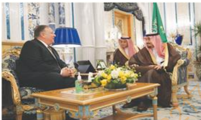
JEDDAH: US Secretary of State Mike Pompeo meets Saudi King Salman bin Abdulaziz on Monday

China also extended financial support worth about $4.6bn to Pakistan during the ongoing fiscal year through commercial loans and safe deposits. China is charging about 5.5pc mark up on commercial loans and about 1pc on deposits while Saudi Arabia and UAE charge about 3.5pc interest.