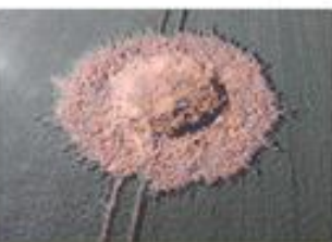
AHLBACH (Germany): An aerial view shows a crater on a barley field. Experts assume that an air bomb dropped during WWII probably exploded at a depth of several metres after the triggering of a chemical device.

To regulate the number of scooters, City Hall has introduced a fee of 50 euros per scooter for the first 499 units, rising to 60 euros for companies operating more than 1,000. The biggest