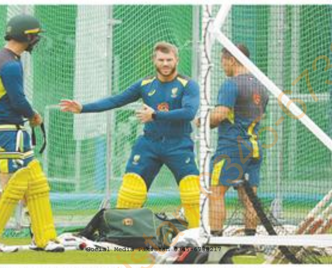
LONDON: Australia's David Warner (C) stretches during a training session at Lord's on Monday

England's rise to the top of the One-day International rankings since their woeful first round exit at the 2015 World Cup has been based on aggressive batting. They have twice posted a world record score at this level in the intervening four years, including the current mark of 481-6 against Australia at Trent Bridge just over 12 months ago. Doubts, however, persist about England's ability to bat in less than ideal conditions for that making. Their problems were summed up against Sri Lanka when Moeen Ali marked his 100th ODI by being the only batsman to repeat the shot not ball and hole out to leave England 170-4. Former England captain Michael Vaughan was unimpressed, writing in the Daily Telegraph: "He [Moeen] was there to win the game but it was dumb cricket taking on the shot at long off having just hit the ball for six." England's problems have been compounded by the absence of Jason Roy from their past two matches, with a top batsman struggling to stabilize the in-form opener from the