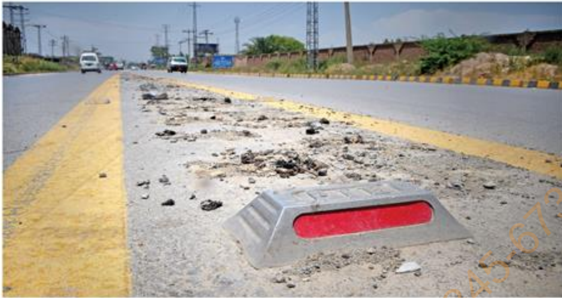
REFLECTORS stolen from the Hayatabad Industrial Zone Road, Peshawar, invite attention of the authorities concerned.