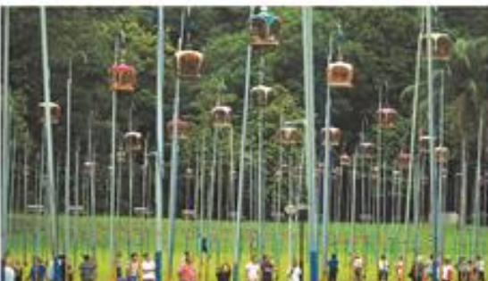
SINGAPORE: Participants and bird owners wait for the start of a bird ringing competition at the Kebun Baru Birdringing Club on Monday.